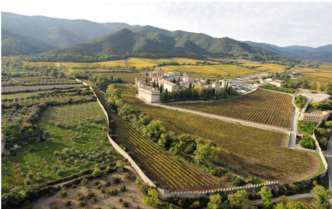
Fig. 1. General aerial view of the monastery complex of Santa María de Poblet in autumn, with the leaves of the surrounding vines already beginning to change colour. The World Heritage Site covers 16 ha and consists of the whole of the area within the perimeter wall, including the gallery forest of poplars and ashes that lines the stream, el Torrent de Sant Bernat.

The royal monastery of Santa Maria of Poblet, the largest monastic complex in Western Europe, was the burial site of the kings of the Crown of Aragon during the thirteenth and fourteenth centuries. It is one of the most important monasteries in the Roman Catholic Church and is today inhabited and run by the same monastic order that founded it nine centuries ago. Its name derives from the Latin populetum for white poplar ( Populus alba ), a tree that grows abundantly along the rivers and streams of the area and whose white bark symbolizes the white habits of the Cistercian monks. The monastery, located at 500 m a.s.l. in the piedmont of the Serra de Prades, forms part of a Natural Site of National Interest created by the Catalan Government in 1984 to protect the landscape around the monastery, which was declared a World Heritage Site by UNESCO in 1991.