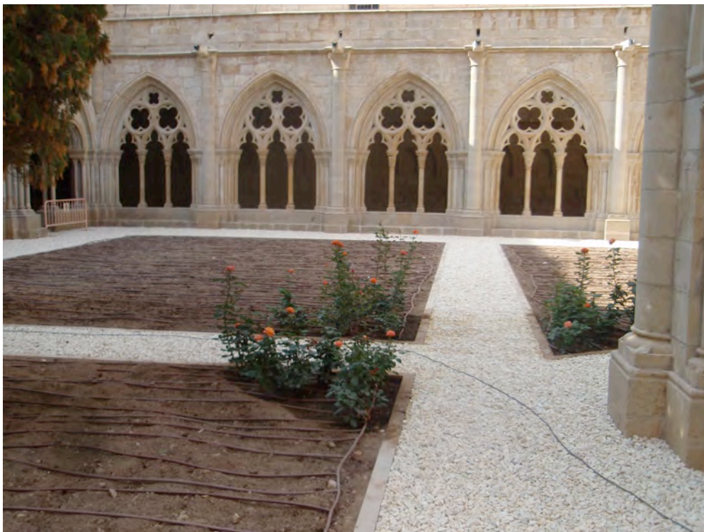
Fig. 9. View of the paths covered by rounded marble chips and the drip irrigation system before it was covered over.

The choice of the plant species planted in the flowerbeds was determined, logically, by the climatic features of the cloister since the aim was to prolong the flowering sequence for as long as possible during the growth period. As well, powerfully scented species were given priority to add sweet aromas to the cloister’s characteristic peacefulness, its birdsong and the murmur of its fountain. Throughout the year, like the flowers, the perfumes change in accordance with the diurnal and seasonal rhythms of the plants, as would have occurred in many Hispano-Moorish gardens.