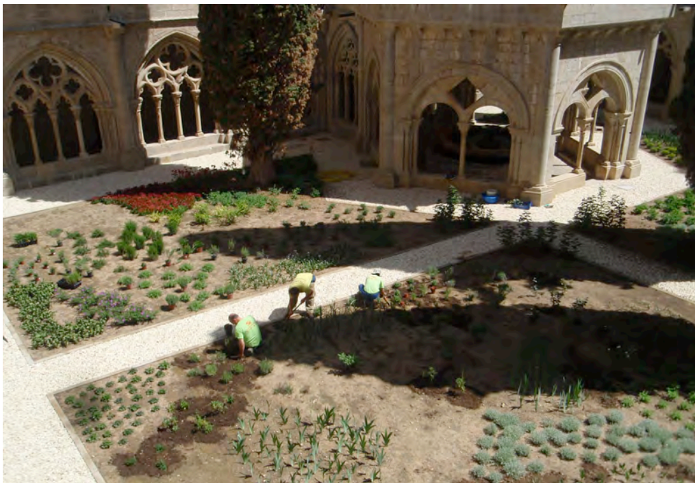
Fig 10. Work underway on the garden in spring 2012. In all, 60 species of plants of the required colours were planted, of which around a third were bulbs.

In order to translate the symbolism of the Cistercian cloister into the flower arrangements, the medieval symbolism of colour was applied following Frédéric Portal (2003). The southern wing of the cloister abutting the church is the shadiest and corresponds to the spiritual dimension; here, white flowers were planted that represent uncreated light, the divine unity, perfection, purity and chastity. The east wing, which corresponds to the mental dimension, abuts the chapter house and contains yellow flowers since this colour symbolizes created light, inspiration and the faith. The north wing, the sunniest and corresponding to the physical or corporal dimension, abuts the refectory and the kitchens and is filled with red flowers that symbolize sanctification, sacrifice and blood. Finally, the west wing that abuts the doorway and entrance used by visitors and guests, which corresponds to the social dimension, is planted with blue flowers since this colour of infinity, and is the third primary colour after yellow and red.