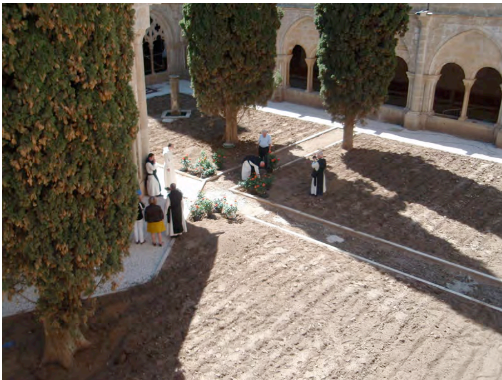
Fig. 8. Restoration of the original quadripartite main cloister garden at Poblet, spring 2012.

This quadripartite garden design is derived from the shape of the cross, the garden's most basic shape. The space inside the Latin cross is the best fit for the architectonic composition of the main cloister at Poblet, above all in the case of the fountain structure, which is off-centre and abuts the north wing.