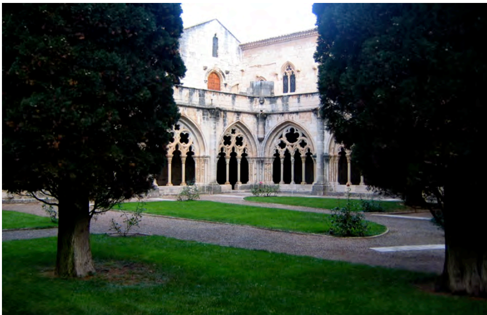
Fig. 3. The garden in the main cloister of Poblet before the work began, with featureless asymmetrical grass lawns, a few rose bushes and the tall cypresses.

Until 2011, the gardens of the monastery's main cloister did not differ greatly from any other garden to be found in the main monuments in Catalonia. The arrangement of the flower beds and grass, enlivened by a number of cypresses, has become commonplace in our country despite the fact that in this region, with its Mediterranean climate that requires plants to be watered during the dry months, there is no historical tradition of gardens in this style.