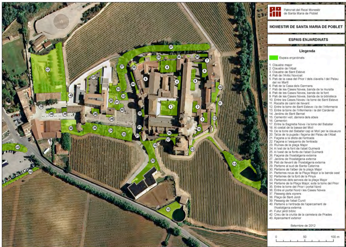
Fig. 2. Situation of the gardens in the Poblet monastic complex in 2012.

This article concentrates on the garden in the main cloister, a jewel of sacred art stylistically situated in the transition between the Romanesque and the Gothic (thirteenth-fourteenth centuries) that historically has always been – and still is – at the heart of this monastic complex (Nº 1 in Fig. 2).