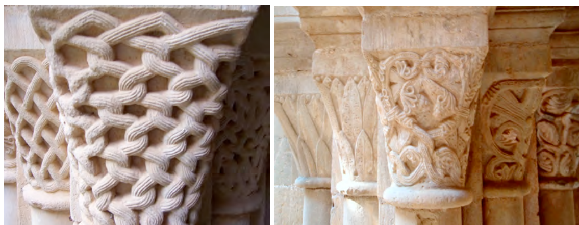
Figs. 6 & 7. Capitols from the main cloister in Poblet (thirteenth and fourteenth centuries). The capitols in the left-hand photograph have a basketwork-like design that evokes the name 'Cister'. On the right, capitols in an Al-Andalus style.

Despite being pure Cistercian in design and architecture, the cloister at Poblet is decorated with attractive Hispano-Moorish elements. Indeed, almost all the capitols contain stylized plant motifs, often characteristically interwoven like basketwork, or flower and fruit motifs that father Agustí Altisent, the monastery's official historian, believes to show a Hispano-Moorish influence. The capitols with basketwork-like design could be a reference to the Cistercian Order ( Cistercium in Latin, Cîteaux in French), given that some authors link the etymology of 'Cister' to cistella (Catalan for 'basket').