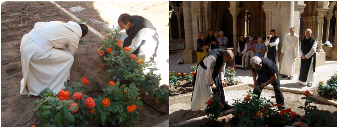
Figs. 12 & 13. The planting of the rose Poblet Abbey in the centre of the garden. This variety of rose was presented to the monastery by a Valencian nursery specialized in the selection and growing of roses.

Consider the lilies of the field, how they grow. They toil not, neither do they spin, and yet I say unto you that even Solomon in all his glory was not arrayed like one of these. Therefore, if God so clothe the grass of the field, which today is, and tomorrow is cast into the oven, shall He not much more clothe you, O ye of little faith? Therefore take no thought, saying, 'What shall we eat?' or 'What shall we drink?' or 'Wherewith shall we be clothed?' (For after all these things do the Gentiles seek.) For your heavenly Father knoweth that ye have need of all these things. But seek ye first the Kingdom of God and His righteousness, and all these things shall be added unto you. Take therefore no thought for the morrow, for the morrow shall take thought for the things of itself. Sufficient unto the day is the evil thereof (Matthew 6, 28-34) (21 st century King James Version).