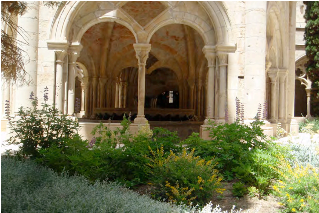
Fig. 11. Summer aspect of the area next to the fountain structure, with yellow flowers on the right (the mental wing) and white on the left (the spiritual wing).

To ensure that all are visible, plants were placed with the smallest on the outside of the flowerbeds and the largest towards the inside. In the centre stand the rose bushes and so all the plants can be admired from the Romanesque and Gothic arches of the galleries that surround the garden.