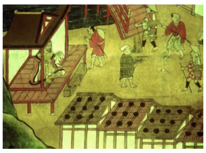
FIGURE 4: The datsue ba at the gate to Yamada town (Jingū Chōkokan).

along the pilgrims' trail. And more important, while the experience at the Heavenly Cave brings the pilgrim into contact with Amaterasu or with other deities and, therefore, with the source of life itself, the Buddhist experience is one of the world after death. This is the more remarkable, I believe, because overtly the religious world of Ise made every effort to keep any contact with death or pollution induced by contact with death outside its precincts, especially outside the space immediately around the sanctuaries. But on the Ise sankei mandala there are hints at the presence of a postmortem Buddhist other world that can be discovered at various places along the pilgrim's itinerary through the sacred realm. As a matter of fact, these hints even follow the order of events that were believed to happen after death.