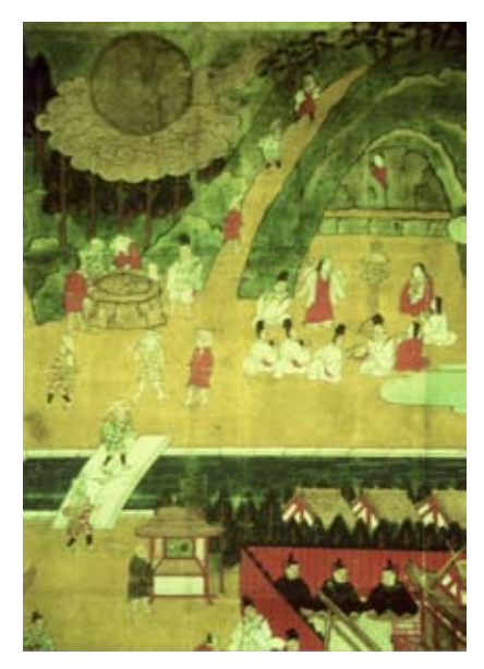
FIGURE 3: Kagura dance of a miko in front of the "Heavenly Cave" (Jingū Chōkokan).

was not necessarily a prerequisite for such a belief. A story in the Seshū kokon meishoshū says that a villager went to the mountain where he heard some strange sounds. On following them he came upon a place where deities and immortals were enjoying themselves, playing music and eating and drinking. When he told the villagers what he had witnessed, they too wanted to see the place. However, when they arrived there the next day they could not notice anything. Nevertheless, the text concludes that "there was no end to such mysterious happenings" (JINGŪ SHICHŌ 1942, 134), hinting that the reported incident was not an isolated event. This seems to suggest that the mountain Takakura and the cave Ame no iwado in particular were haunted places where everything could happen because here was the point of contact between this world and the other world, a "locality where the kami hide," kami kakushi no sato 神かくしの 里 (JINGŪ SHICHŌ 1942, 134).<sup>6</sup>