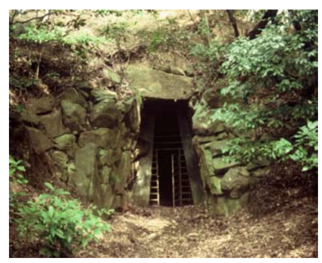
FIGURE 2: The stone structure, Ame no iwado, on Mount Takakura.

I have already mentioned that the top section of the Ise sankei mandara differs from the lower sections in that it offers a glimpse into another world, a spiritual world. This world, however, is not represented by abstract symbols but by concrete images of persons and things as they exist in the physical world. One of the locations where the pilgrims could come in quasi-physical contact with this other world was a stone structure erected on Mount Takakura 高倉山, a hill of low elevation (117m) behind the Outer Shrine. This structure is known by various names, but in popular tradition it was widely known as Ame no iwado 天の 岩戸 and is believed to be the cave where Amaterasu hid herself after she had been put to shame by her brother Susanoo (FIGURE 2). Today the cave is said to be a kofun 古墳, but the Shinkyō kidan 神境紀談, a text compiled in 1700, quotes many traditions of the Edo period which say that the cave had once been the abode of evil or unruly deities who were eventually overcome and driven out by the power of Toyouke, the deity of the Outer Shrine located at the foot of the mountain. In the vicinity of the cave was also some flat open space which was known as Takama no hara 高天原, the "High Heavenly Plain" of mythology