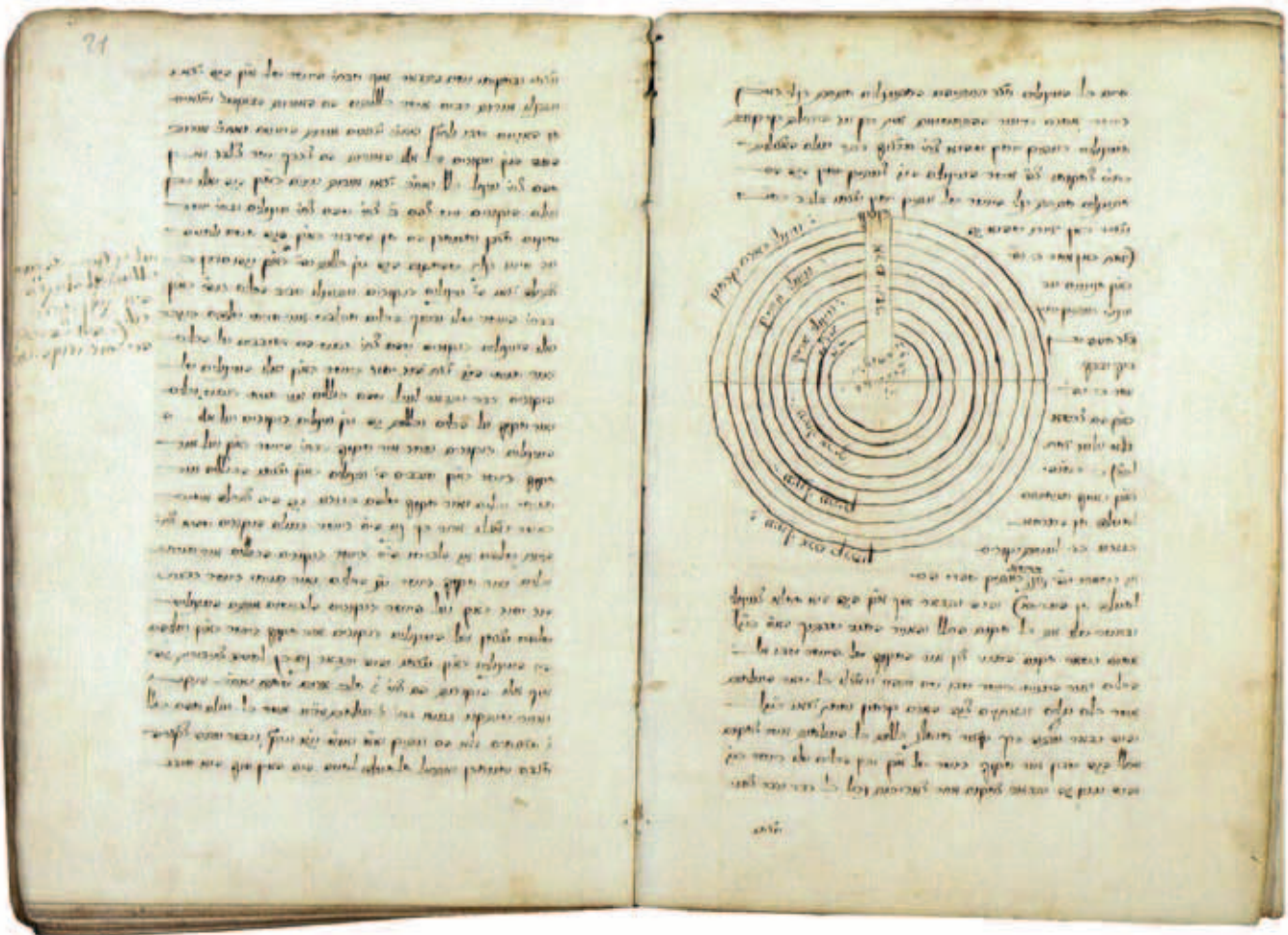
Fig. 3. Kabbalistic diagram in Hayyim Vital. Sefer 'Ez Hayyim . Mantua, the Library of the Jewish Community, Ms. 50, fols. 20v–21r